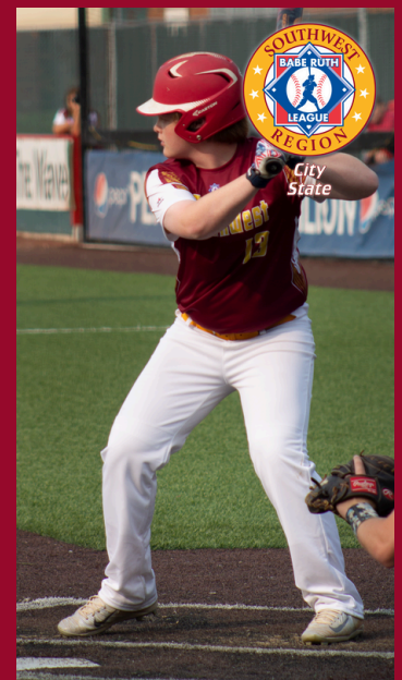
#00 Player Name 14-Year-Old

OFFICIAL EVENT PHOTOGRAPHY WILL BE SOLD PRE-SALE AND ONSITE BY PHOTOMULES.